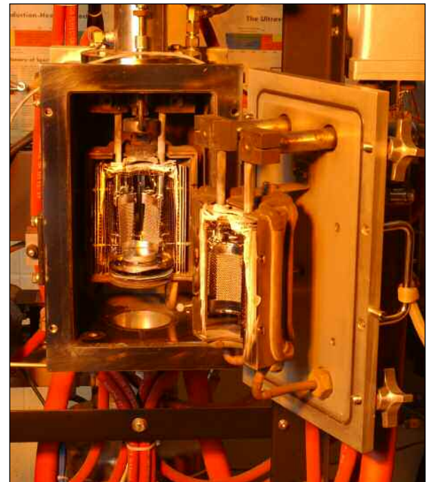
Interior, close-up view of research furnace in Edgar’s chemical engineering lab.

“ . . . gallium nitride has evolved from a research laboratory curiosity to one of the world’s most important semiconductors.”