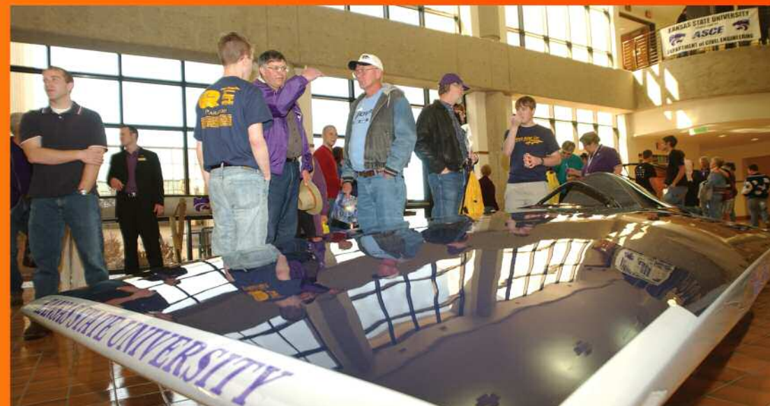
(above, left to right) EECE Superheros skit; CE tackles traffic situation in Yellow Brick entry; BAE cave dwellers 'whoop it up'; off on a cruise ship with IMSE; solar car team's latest vehicle, Paragon, a popular stop in Fiedler Atrium.