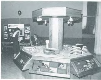
Black & Veatch industrial display.