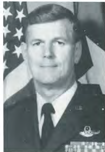
Gen. Richard B. Myers

"The College of Engineering is very proud to have Gen. Myers as its 1990 Alumni Fellow," he continued, "and we look forward to having him on campus to interact with our students."