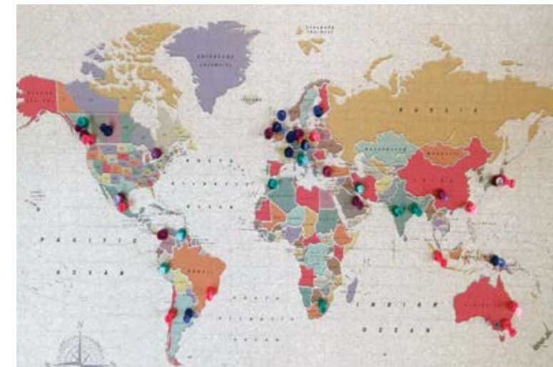
MEMBERS OF THE CHE CLASS OF '68 DOT THE WORLD MAP WITH STICK PINS OF EACH LOCATION THEIR COLLECTIVE CAREERS HAD TAKEN THEM OVER THE YEARS.

"Many there expressed their gratitude to our professors and K-State for the tools given them to achieve careers far beyond any of our expectations in June 1968!"