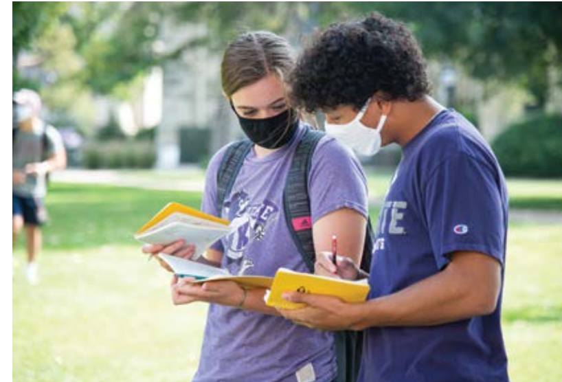
ABOVE: EVEN OUTDOORS, MASKS ARE THE ORDER OF THE DAY AS STUDENTS CHECK NOTES FOR A SURVEY CLASS ASSIGNMENT.