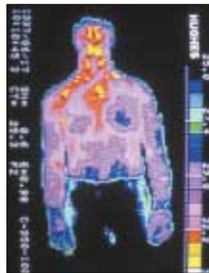
IER thermal image

All thermal comfort standards in the U.S. and most developed nations throughout the world today, established by the American Society of Heating, Refrigerating, and Air-Conditioning Engineers, come from data