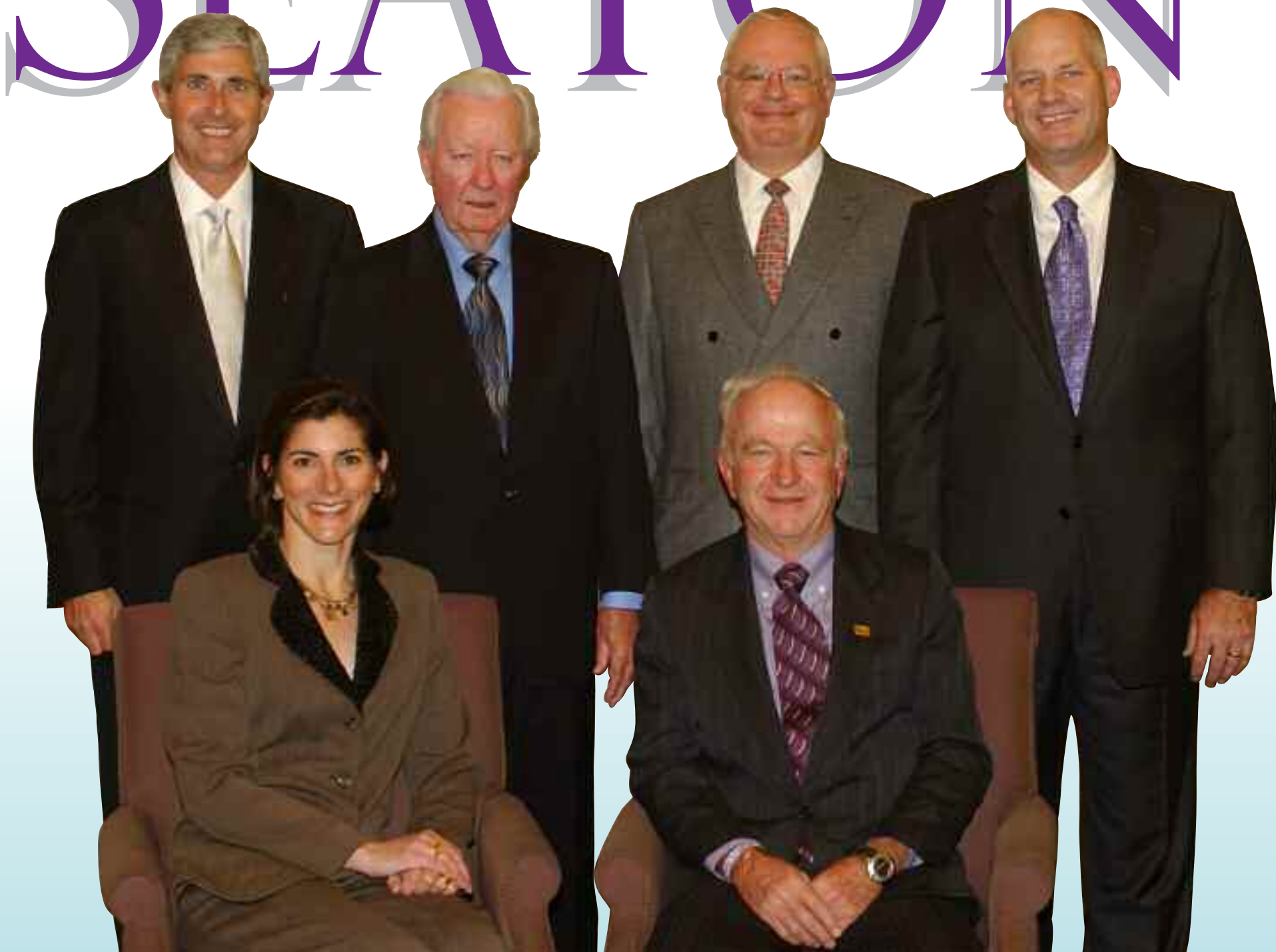
HALL OF FAME