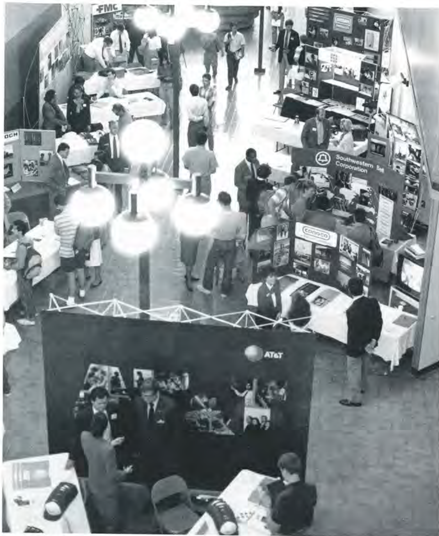
Durland Hall was a hub of activity as students had opportunity to visit display booths of nearly 50 industry and government representatives at the 6th annual Engineering Career Fair, Sept. 19. The Career Fair, and Industry Recognition Banquet, Sept. 18, were both sponsored by the KSU Minority Engineering Program, for the purpose of exposing engineering students to opportunities available in the job market.