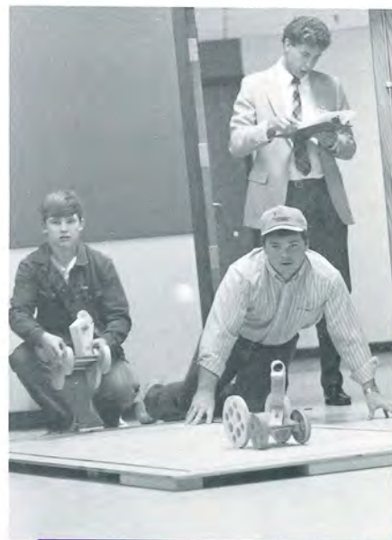
An Open House guest watches his entry in the mousetrap launcher competition.